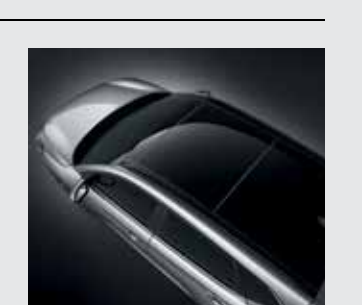
Panorama Sunroof (Panoramic View)