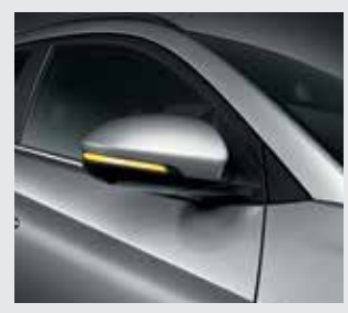
LED Outside Mirror Repeaters & Puddle Lamps

The new Tucson's Full LED Headlamps with Positioning Lamps and Low Beam Assist-Static lights, together with LED Rear Combination Lamps with improved visibility, offer not only a new look, but better reliability and safety.